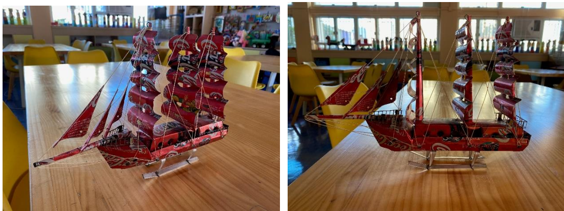
工藝：把汽水罐組合及改造成小帆船玩具 Craft: Combine and transform soda cans into small sailing toys