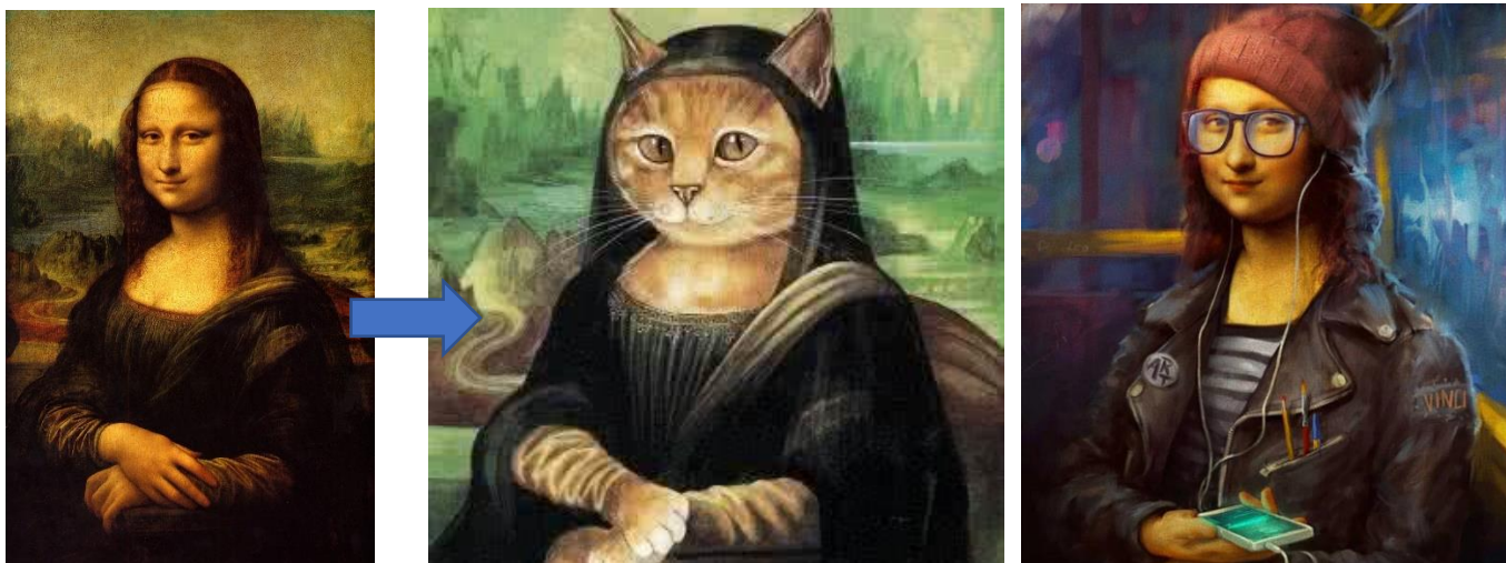
繪畫：把蒙娜麗莎 (李奧納多·達文西) 改變成「蒙娜貓咪」 / 現代妝扮的蒙娜麗莎 Painting : From Mona Lisa ( Leonardo da Vinci ) to other creation.